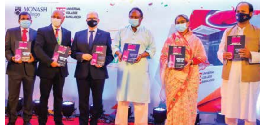
INAUGURATION CEREMONY OF MONASH COLLEGE PROGRAMMES at Universal College Bangladesh (2021)