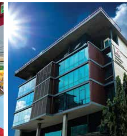
LOCATION SA Tower, 1 Gulshan Avenue, Dhaka