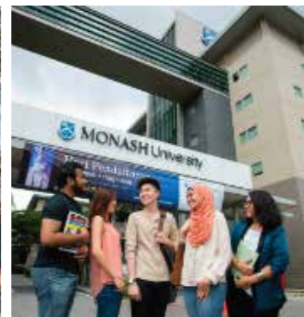
LIVE IN MALAYSIA Study in Monash University Malaysia upon successful completion at UCB