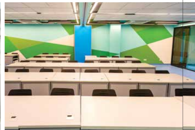
CLASSROOM Cutting-edge learning area