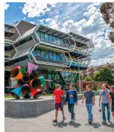
LIVE IN AUSTRALIA Study in Monash University Australia upon successful completion at UCB