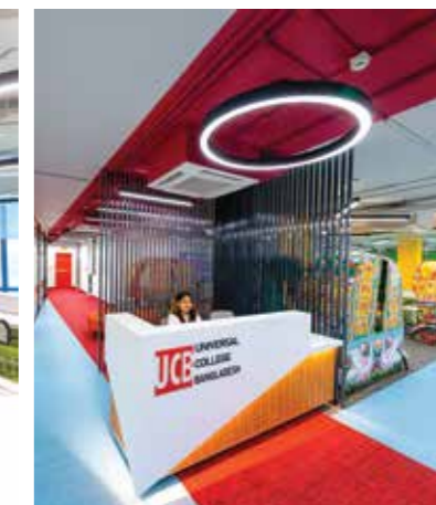
COUNSELLING AREA State-of-the-art campus